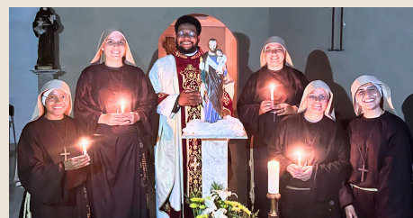
SANTA CRUZ, RJ