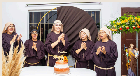
VILA VELHA, ES

On March 19, the Institute of the Poor of Jesus Christ joined the universal Church in celebrating the Solemnity of Saint Joseph, spouse of the Blessed Virgin Mary. The Eucharist was celebrated across the Institute's missions, bringing together all members around the altar under the patronage of the most chaste guardian of the Redeemer.