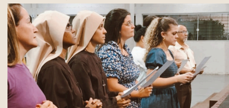
IGUAZU FALLS, PR

The Holy Mass was held at the São José Operário Evangelization Center, where mission members renewed their dedication to Saint Joseph.