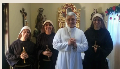
SAN ANTONIO, HONDURAS