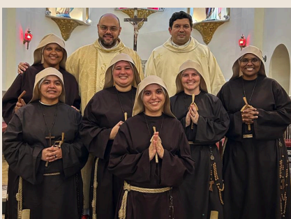
SÃO CRISTÓVÃO, RJ