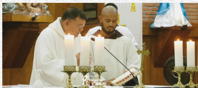
SANTA CRUZ DE LA SIERRA, BOL

"As a man chosen to proclaim the Gospel of God (Rom 1:1), Saint Paul stands as an exemplary model of evangelization for us. His unwavering commitment to spreading the Gospel and his total devotion to Christ inspire us, along with the many challenges he faced: persecution, risks, and suffering." (NF123-124)