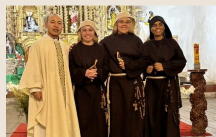
CANAS, YANAOCA, PERU