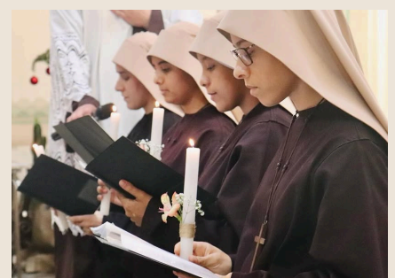
PORTO ALEGRE, RS