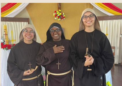
TORO PAMPA, PARAGUAI