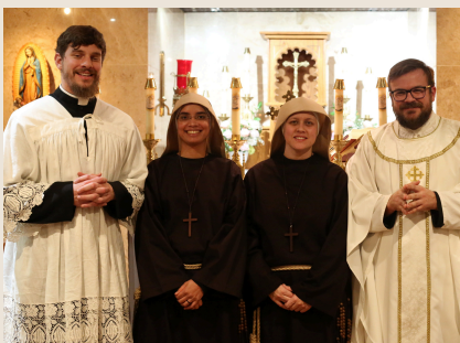
KANSAS CITY, KANSAS, USA

personal commitment to follow the path of Christ with radical generosity. More than just a symbol of surrender, this moment serves as a tangible testimony that, even amidst challenges, it is possible to persevere in the pursuit of higher ideals, as expressed in Saint Paul's letter to the Colossians (cf. Col 3). Ultimately, it represents a wellspring of hope, showing the contemporary world that true joy is found in dedicating oneself to a cause greater than oneself, in trust and surrender to Divine Providence.