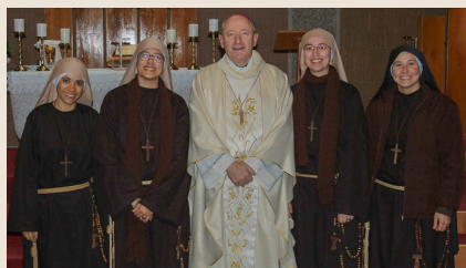
WATERFORD, IRELAND A Holy Mass for the renewal of vows in Waterford took place at St. Saviour's, presided over by the diocesan bishop, Alphonsus Cullinan.