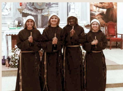
CIUDAD DEL ESTE, PARAGUAY