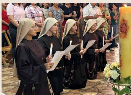
CORONEL OVIEDO, PARAGUAY