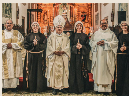
SÃO LUIS, MA